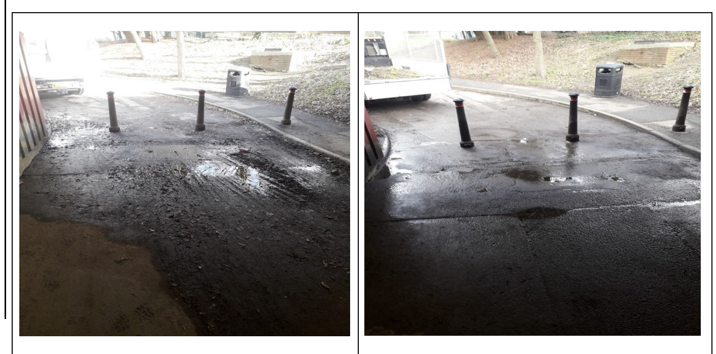
Woolborough Lane: Before cleaning

Photographic Impact Evidence (a selection of photos of work undertaken to demonstrate impact)