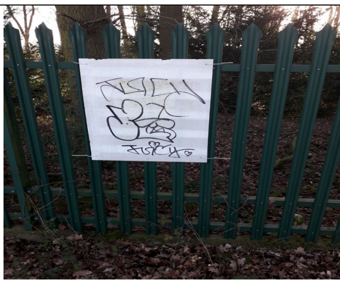
Graffiti taken down along Magpie Walk