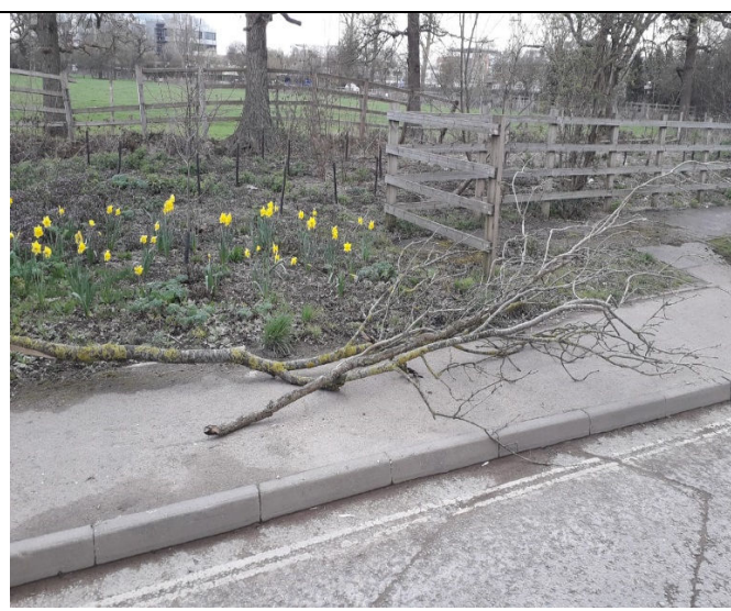
Clearing the deadwood from the verges and roundabouts